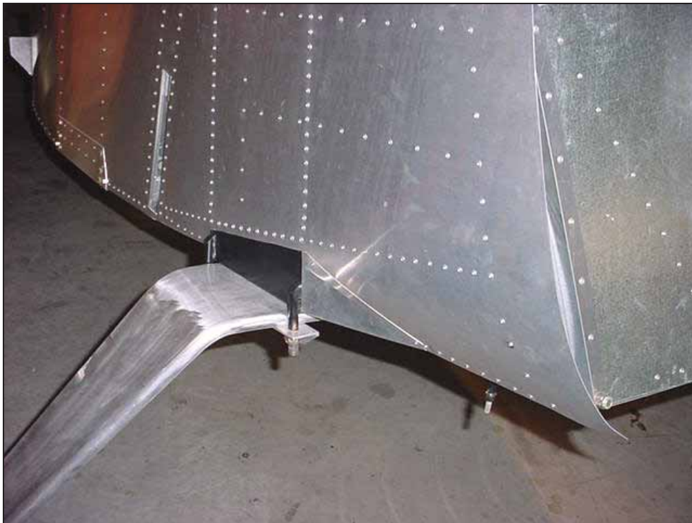
Photo of the fuselage with the wing removed.