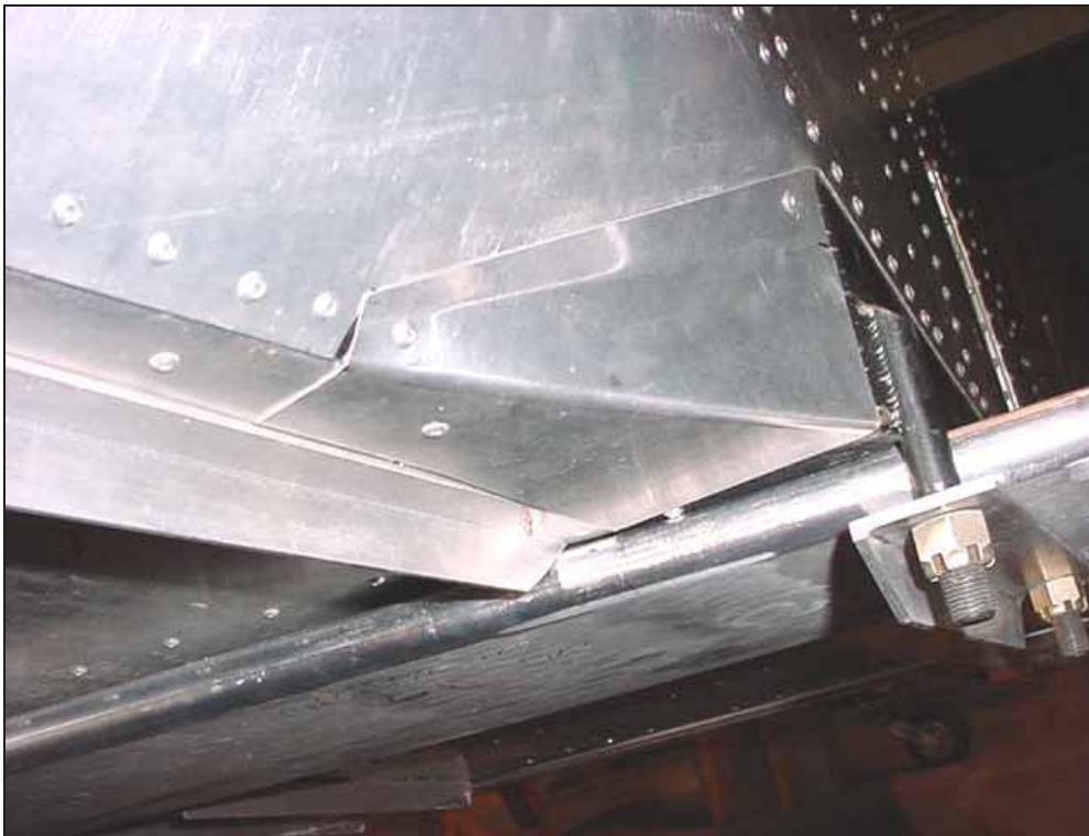
Standing looking up at front left side of landing gear.