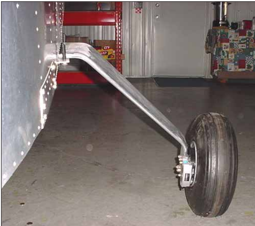
TD gear with 600x6 wheels

No changes to 6B10-4, see fuselage assembly section 6-B-14 page 10 of 10