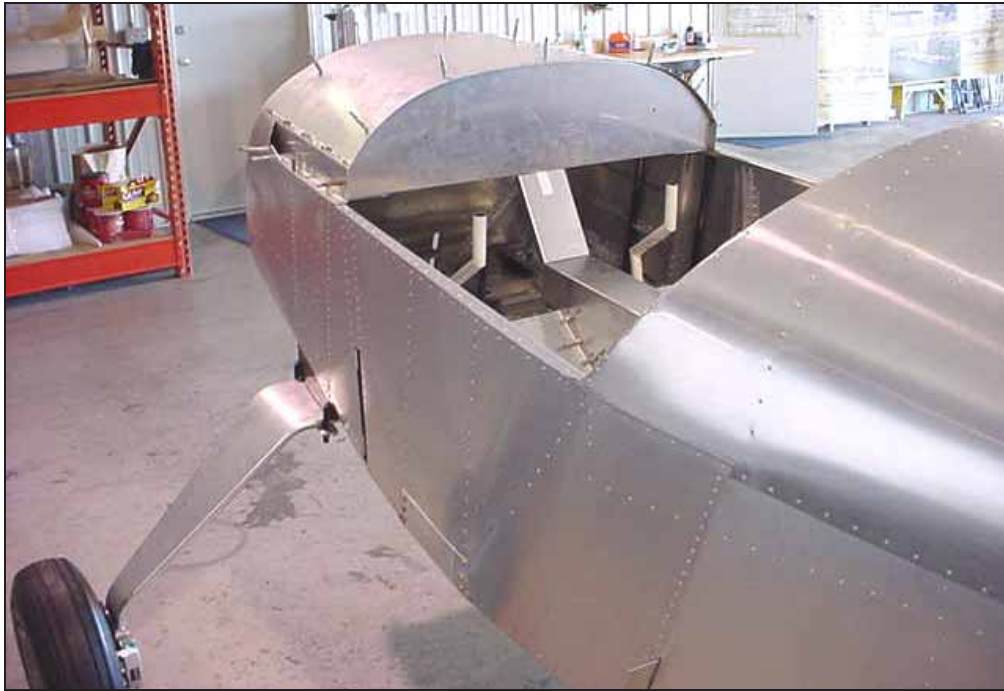
Gear is installed to the fuselage with the Main Gear Support 6G3-4

No changes to 6B10-4, see fuselage assembly section 6-B-14 page 10 of 10