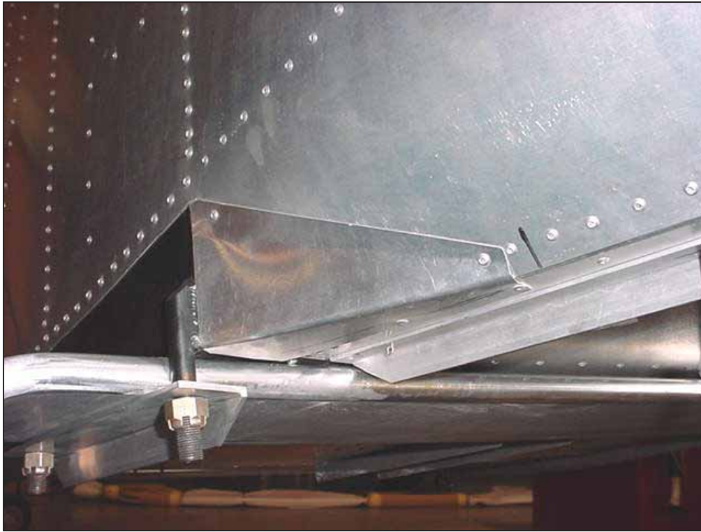
Right side fairing