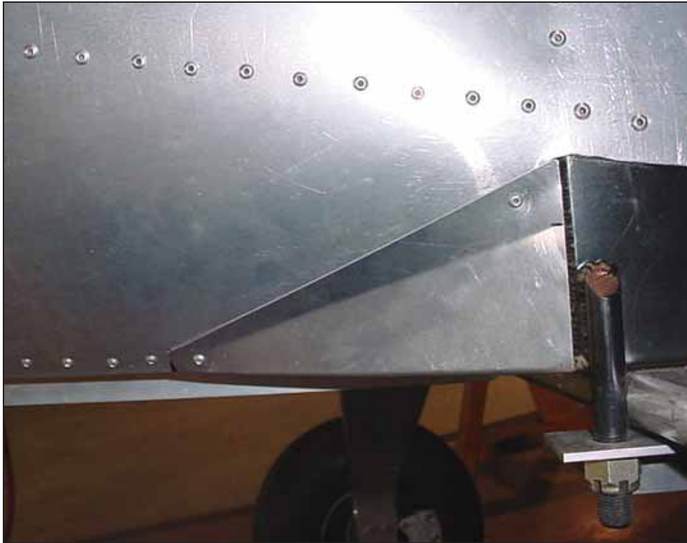
Fairing to close gap in front of Gear Uprights 6TD3-1