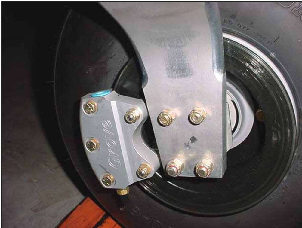
600x6 main wheels

IMPORTANT: Grease and pack the bearings.