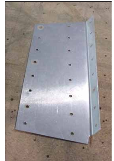
6TD3-3 SUPPORT EXTENSION