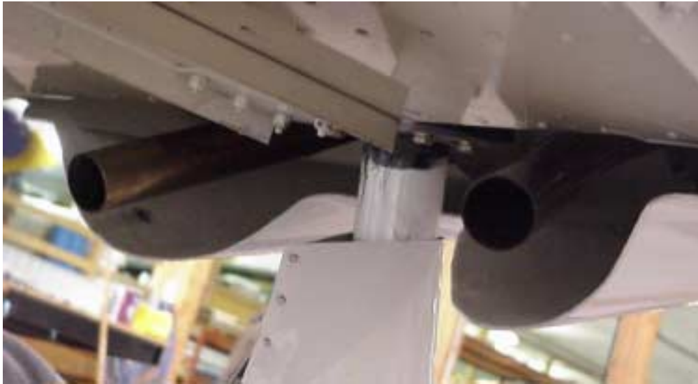
Outlets in line with the cowl