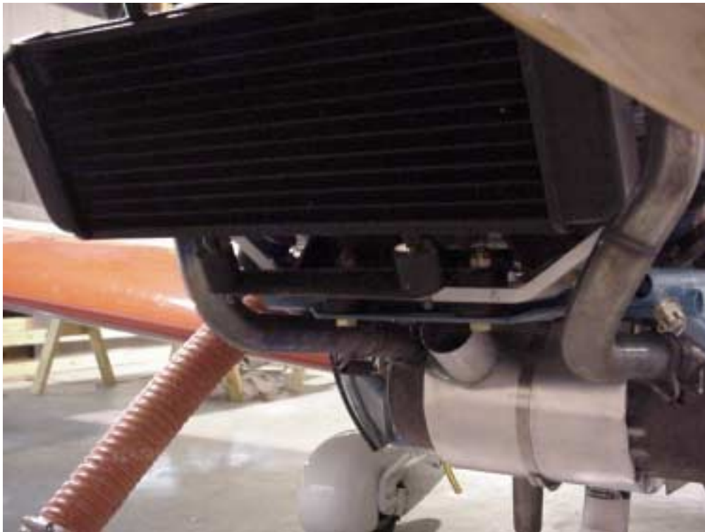
Heat shroud installed around muffler with one large hose clamp.