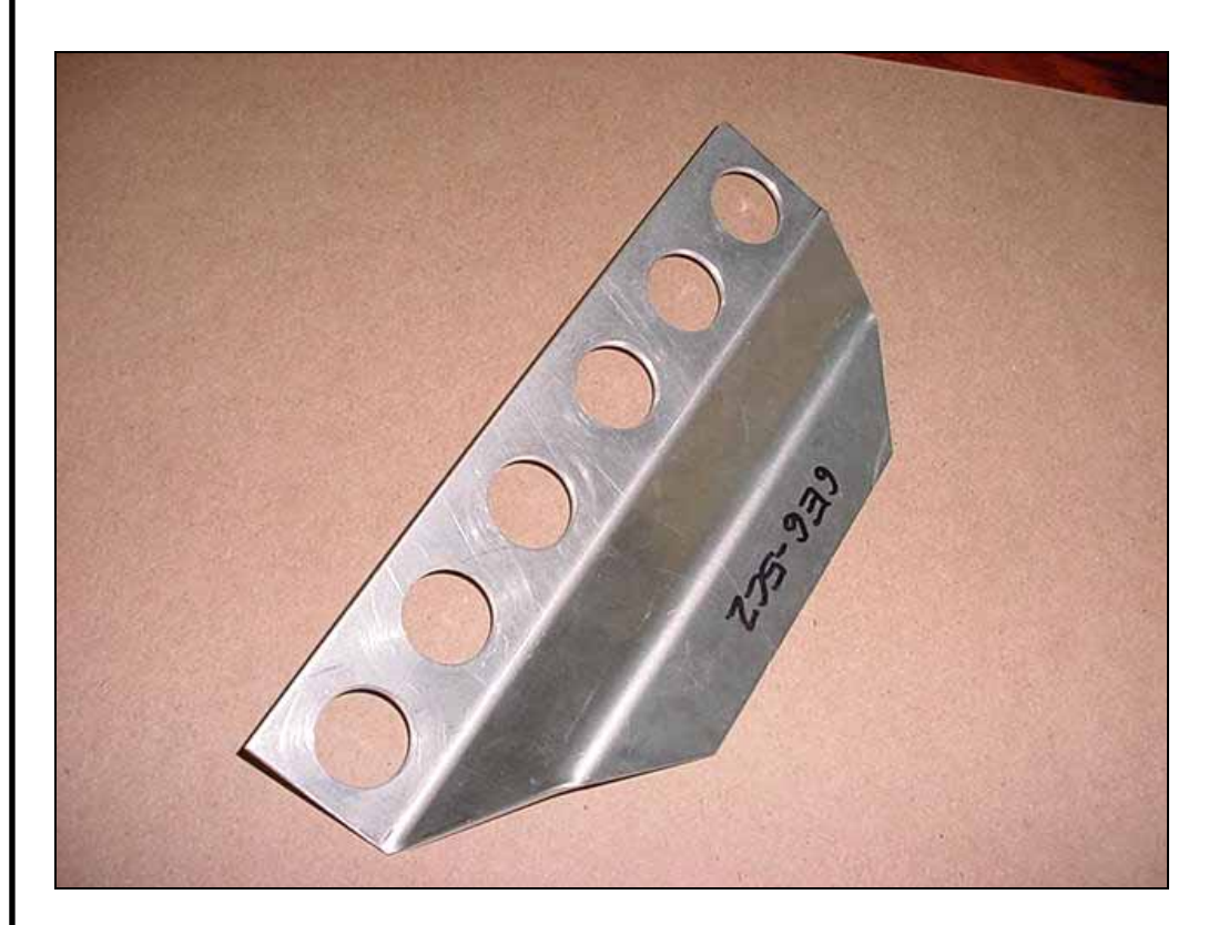
6E6-5CZ Oil cooler bracket (qty=1)