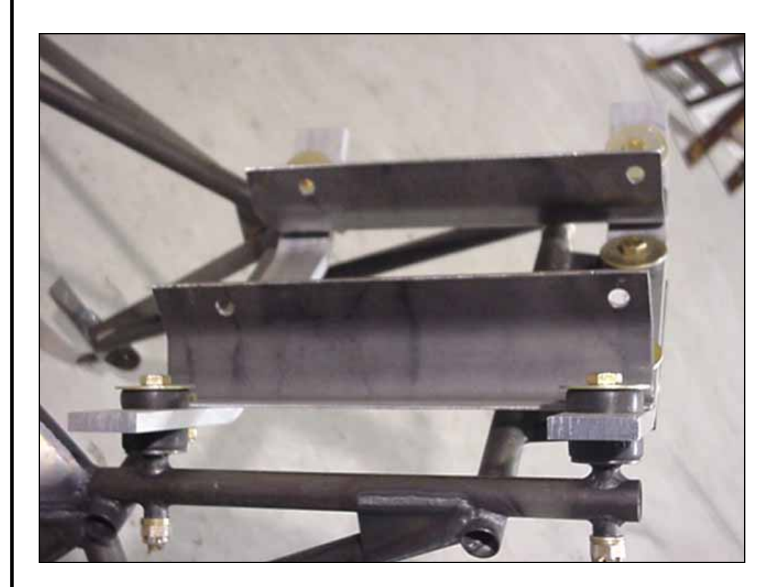
Holes in E1-1X to bolt the engine.