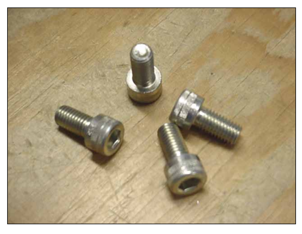
M10x1.5x20 12.9 BOLTS QTY: 4