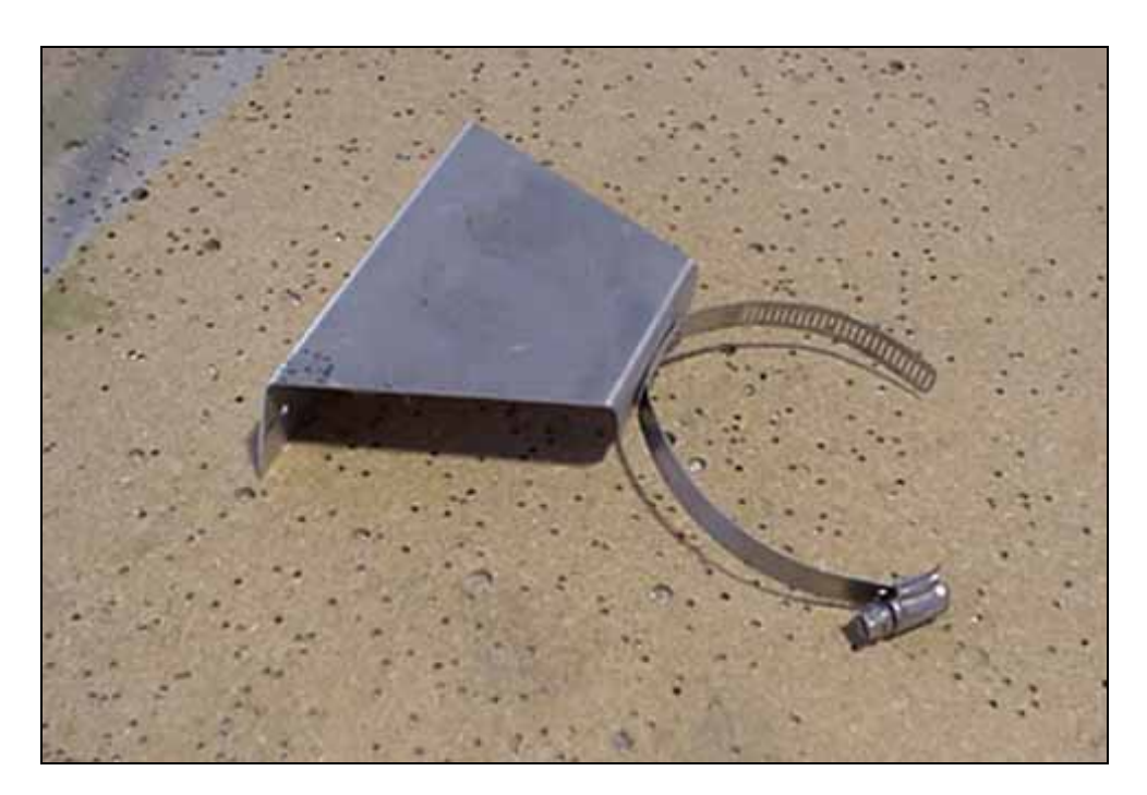
OIL TANK TOP SUPPORT