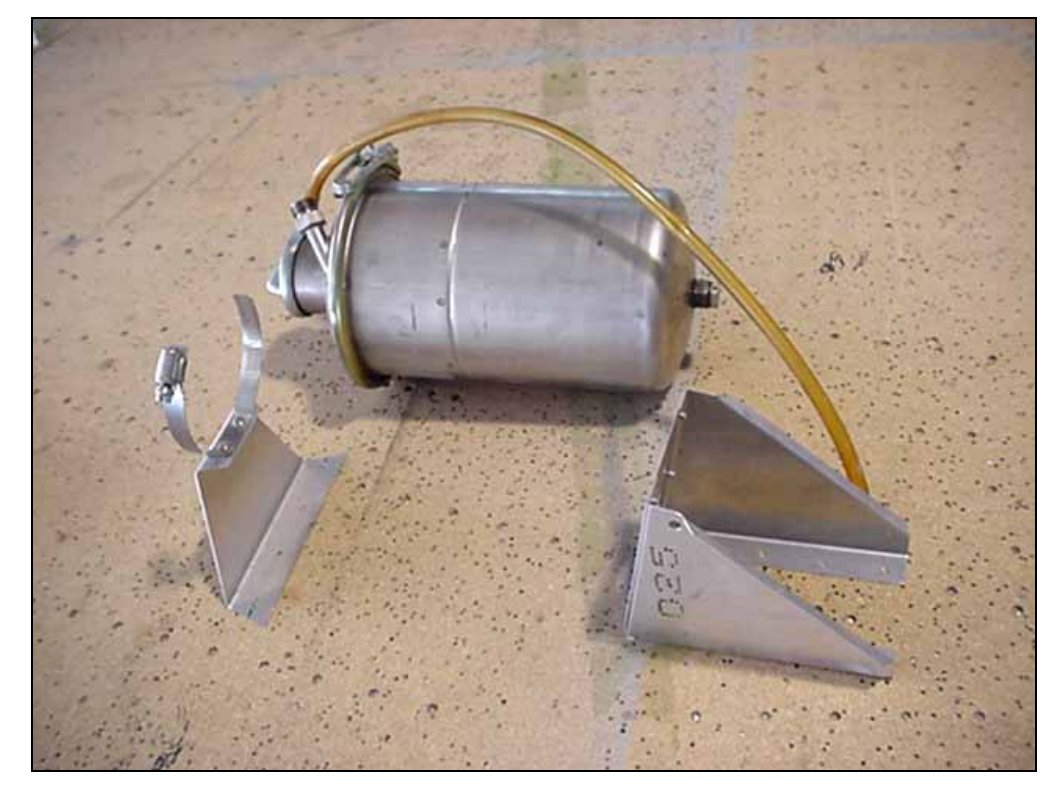
Oil reservoir for Rotax dry sump.