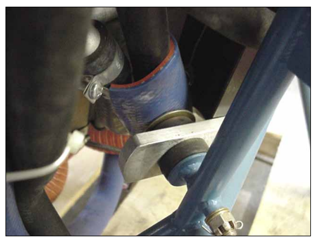
Piece of radiator hose sliced open (approximately 3 inches long)