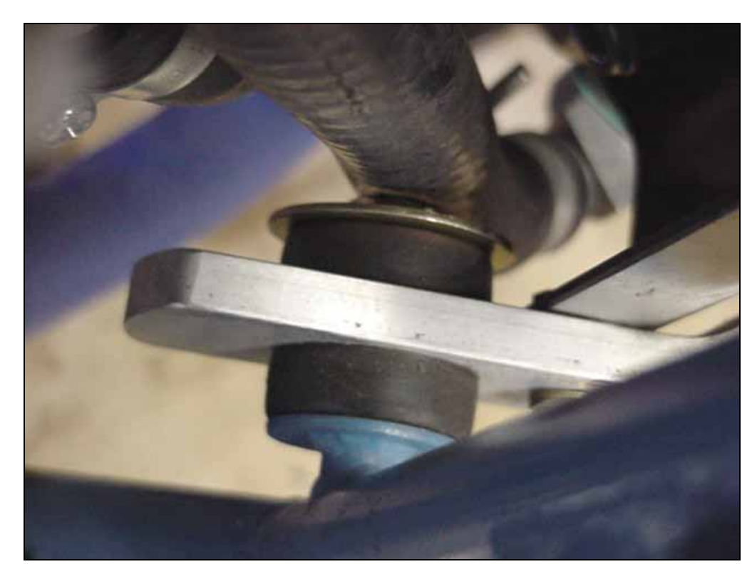
Rear right hose makes overtop the bolt