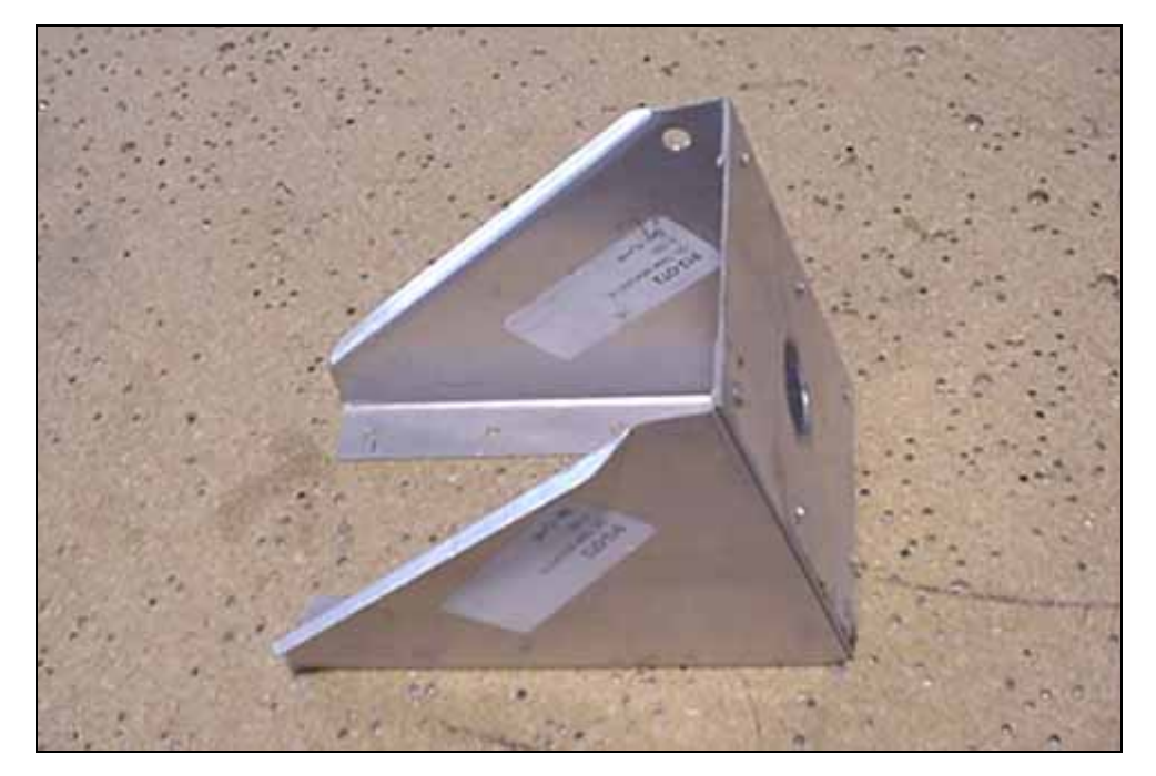
6E6-1 OIL TANK TOP BRACKET