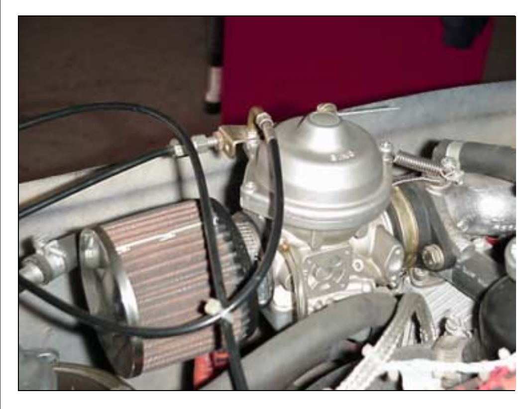
Photo of 912 engine without the Tuned Rotax Airbox Photo of left side

Location of air filter on the back of each carburetor. Photo of right side.