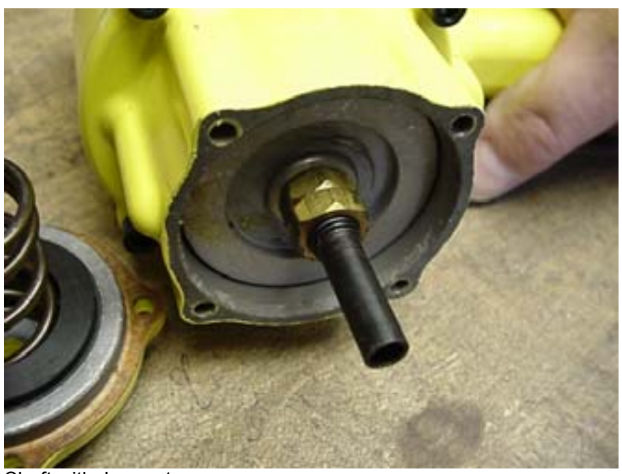
Shaft with Jam nuts.