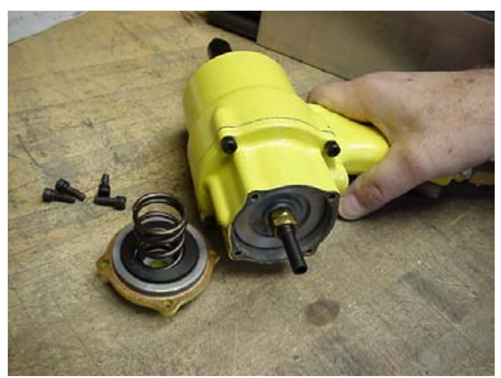
Connect the airline and pull the trigger, hold down the trigger. The next step is to tighten the 2 jam nuts.

SOLUTION: Tighten the 2 jam nut on the shaft.