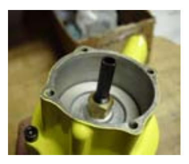
CAUTION There is a SPRING under cover pushing up on the cover.

First loosen the 4 Allen screws. Then Push down on the cover with one hand to remove the 4 Allen screws.