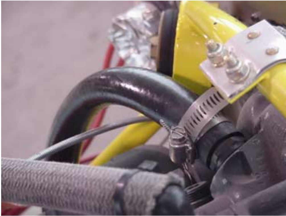
Hose clamp and safety wire.