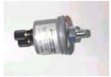
OIL PRESSURE SENSOR 150 SPI THREADS 1/8" NPT Qty = 1