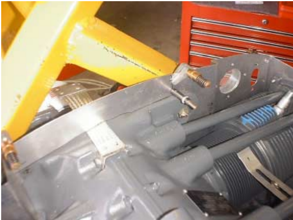
Bolted to case