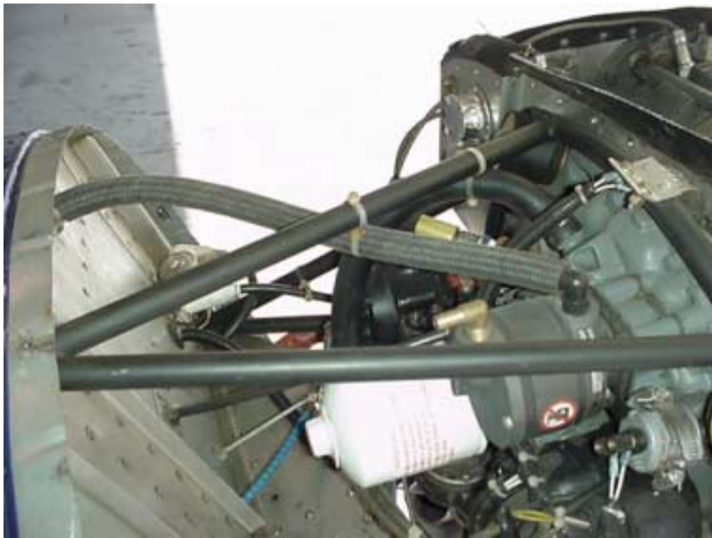
Top rear of engine