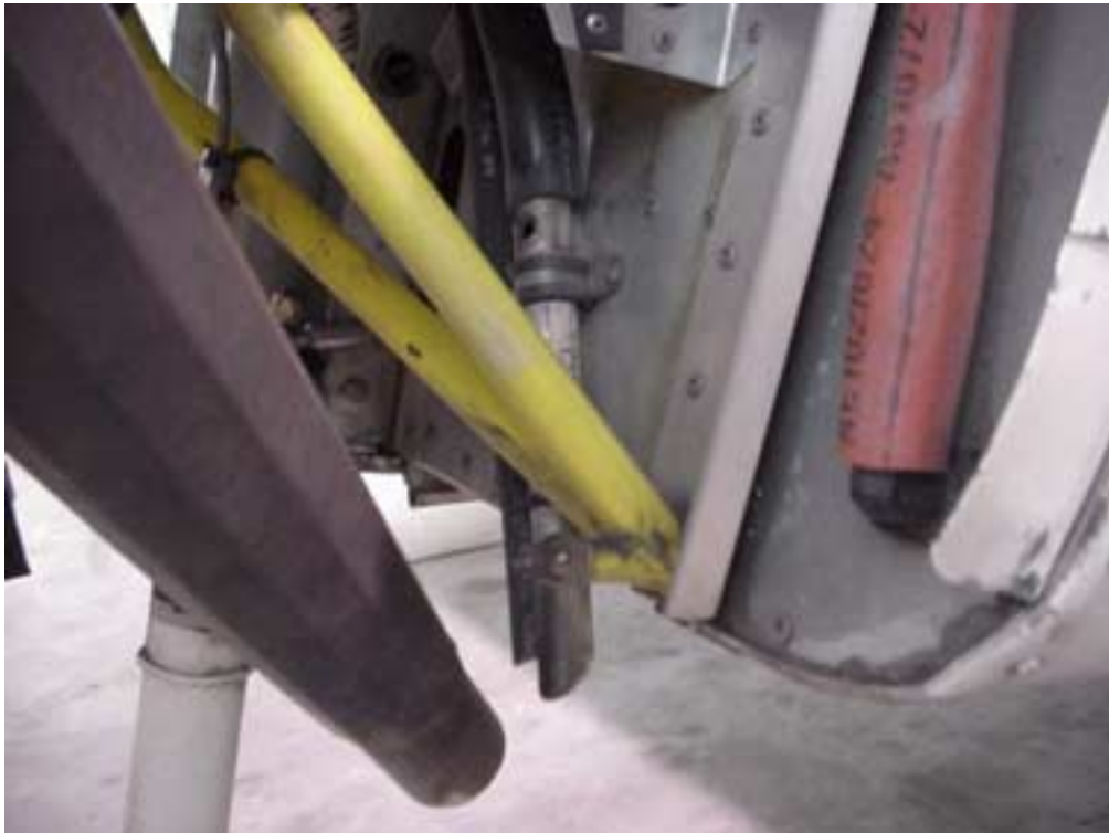
Vent hose to tube at bottom of firewall.