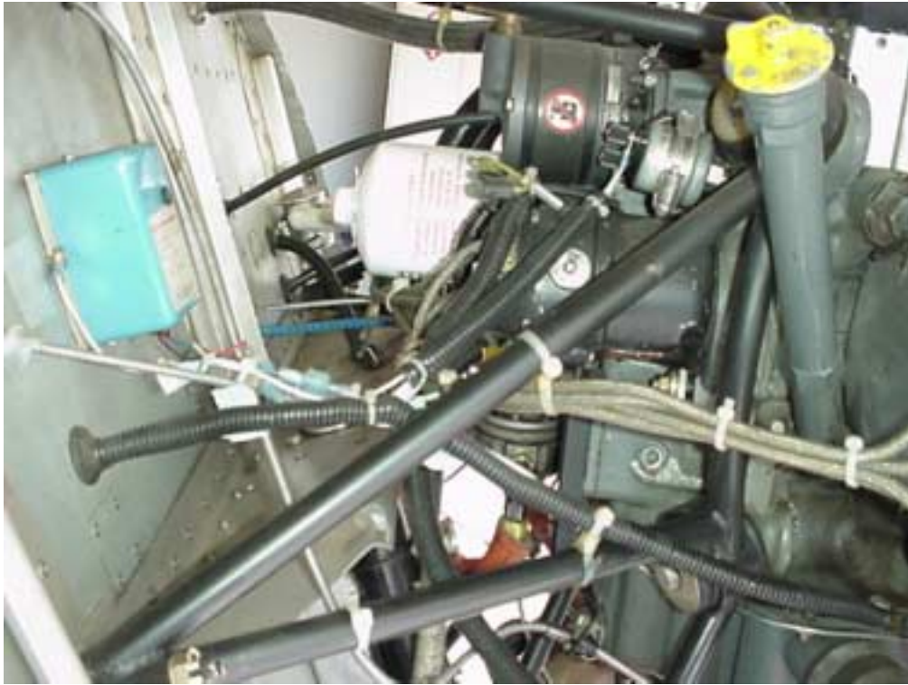
Oil pressure sender wire connection.