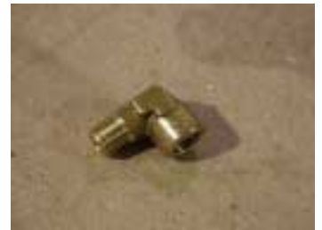
90 DEGREE ELBOW P/N F116-A 1/8" PIPE NPT