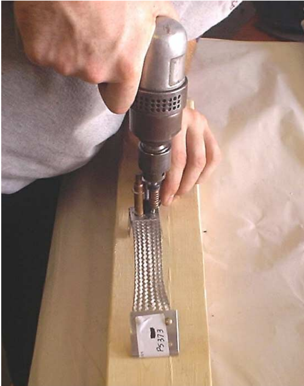
Grounding engine to engine mount