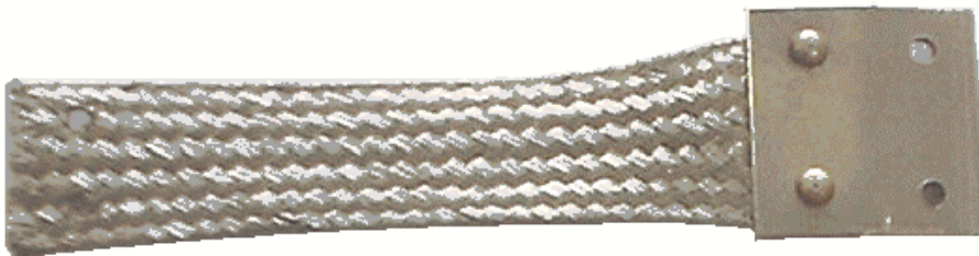
Engine grounding strap 1" wide