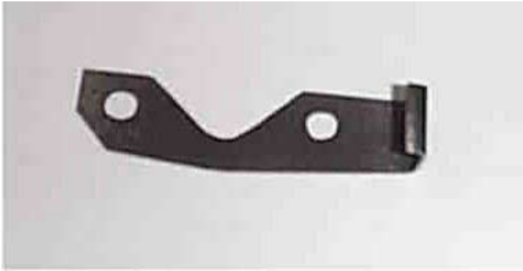
Support bracket bolted to engine for oil pressure sensor