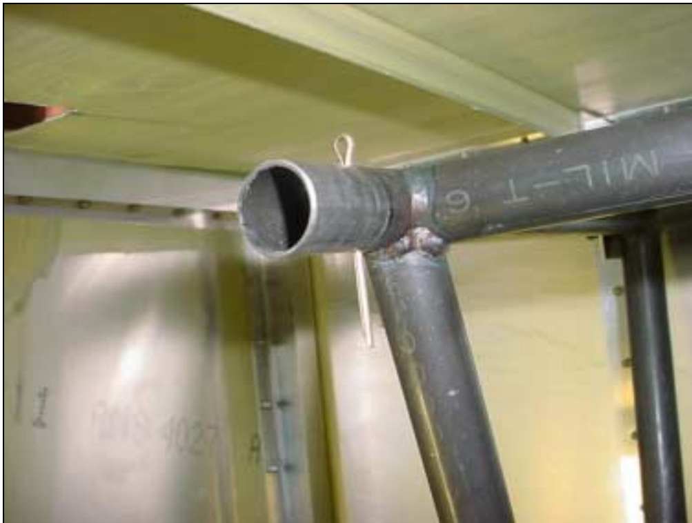
COTTER PIN AN380-3-6

Hole is located approximately 10mm from the bottom of the Flaperon Control Mount 7C1-1 to bolt the Flaperon Control Lever 7C3-2.