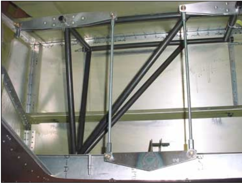
The Bellcrank assemblies' 7C1 are level with the top of the Horn 7C2-3.