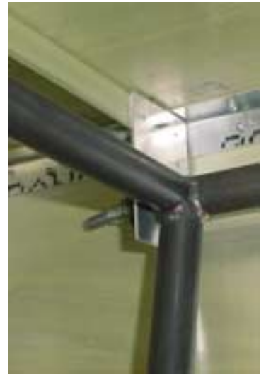
Detail of left side.