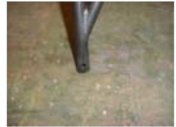
Drill a 1/4" hole at the bottom of the Mount 7C1-1

Hole is located approximately 10mm from the bottom of the Flaperon Control Mount 7C1-1 to bolt the Flaperon Control Lever 7C3-2.