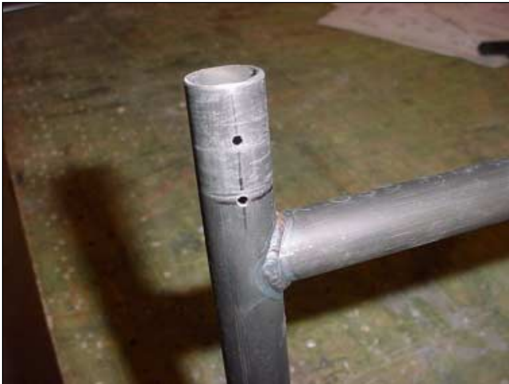
FLAPERON CONTROL MOUNT 7C3-1

The Bearing fits on the inboard side of the 'L' angles; ref. drawing 7-F-6. First drill the 3/4" hole in the Bearing. Then radius the corner opposite the 3/4" hole to make room for the radius of the 'L' angle. Clamp the Bearing to the 'L' angle to mark the rivet line. Drill & Cleco.