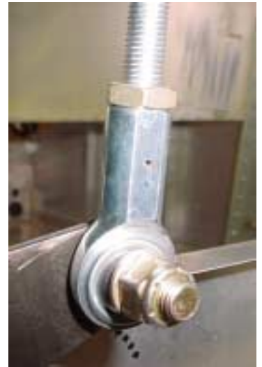
CHECK: 5mm clearance between the head of the bolt and the aft flange of the Channel 7F6-1.