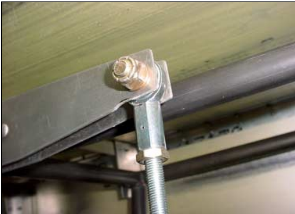
2 washers: one under the nut, 1 washer on the aft side of the rod end and the bellcrank. File a notch in the aft Bellcrank to make room for the Rod End when the Flaperons are down.