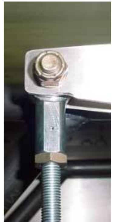
NOTE: The Rod is visible through 1/16" hole.