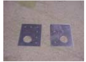
FLAPERON CONTROL BEARING 7F6-3