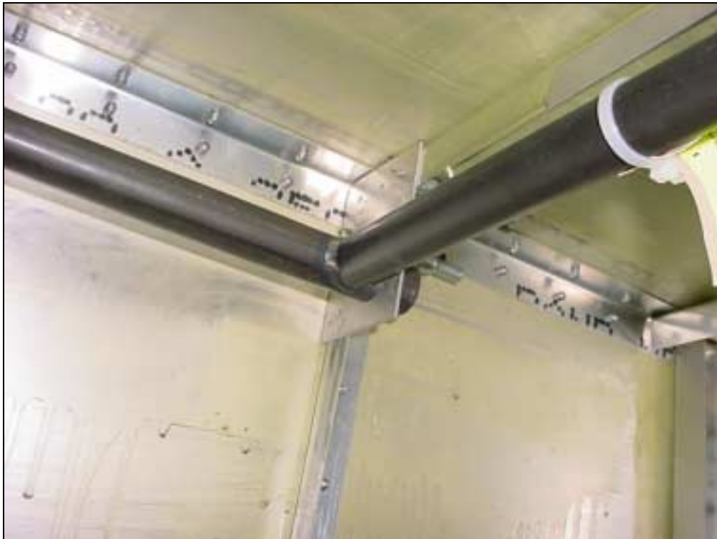
Photo shows cotter pin on the aft side of the Flaperon Bellcrank.

The Flaperon Bellcrank assemblies can be installed on the Flaperon Control Mount before the mount is installed in the Fuselage.