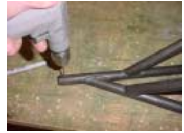
First drill a pilot hole.