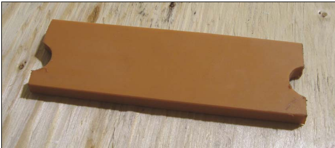
P/N: 75L2-2 Main Gear Support Rubber

The bolt holes for the Axles are matched drilled on the Gear Spring. Install the Axles on the Gear Spring. Then install the Wheels on the Axles.