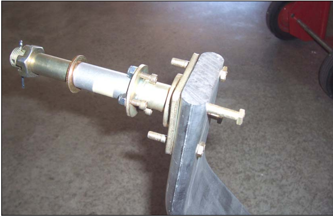
Matco Main Gear Axle

The bolt holes for the Axles are matched drilled on the Gear Spring. Install the Axles on the Gear Spring. Then install the Wheels on the Axles.