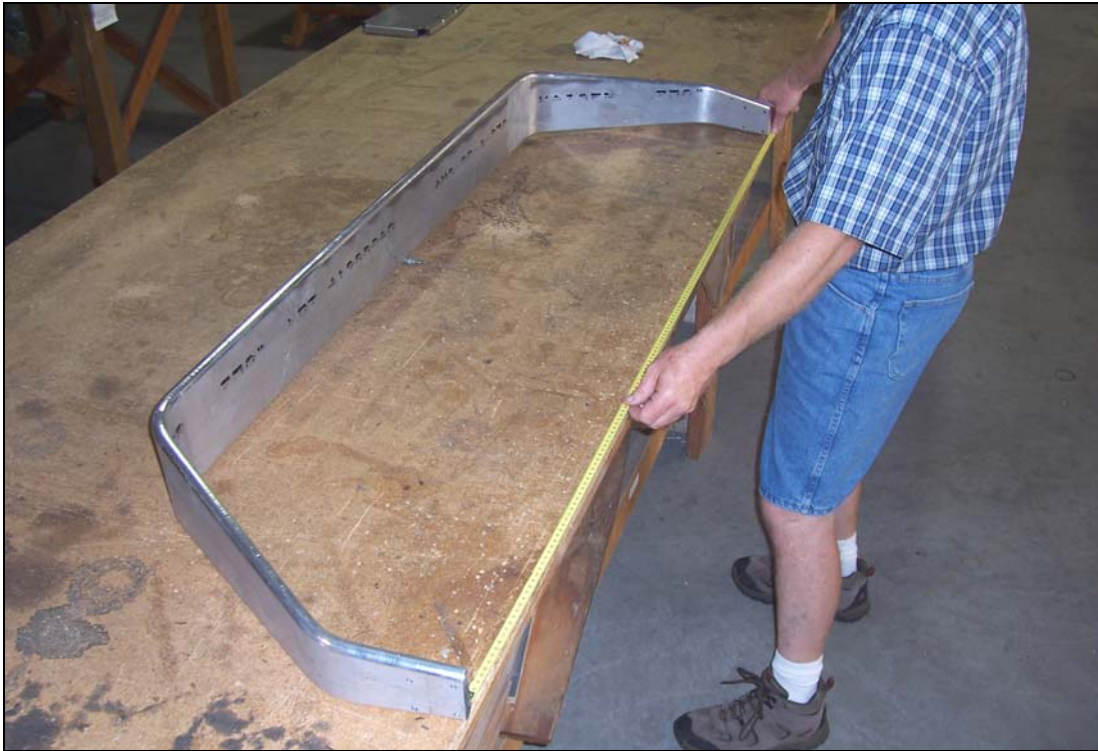
P/N: 75L2-1 Tundra Main Gear Spring

Orientation: The 'flat' side of the Gear Spring is the aft side.