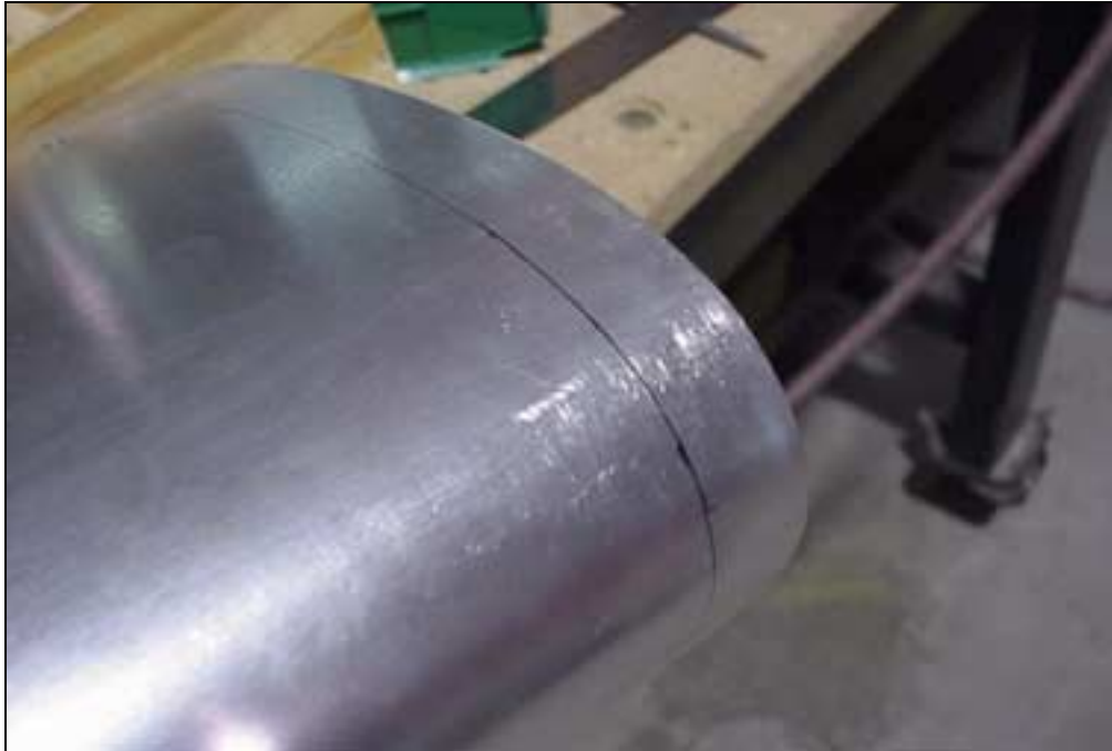
7S1-2 IB Slat Skin

Before the slat can be positioned on the wing the positioning template will need to be made. This is needed for the correct distance from the leading edge of the wing to the bottom corner of slat (DWG 7-S-2).