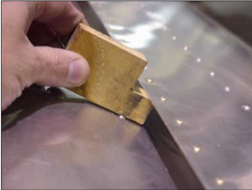
Trailing Edge Template

The trailing edge slat is 16mm above the wing nose skin. Using a small block will work to hold the slat at this distance.