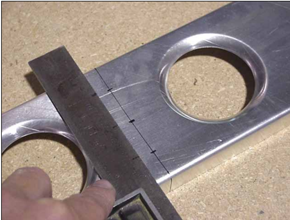
7H2-8 Elevator Spar

Layout the location for 7H1-7 rear ribs on 7H2-8 spar. Mark and predrill the holes in the spar for the rear ribs.