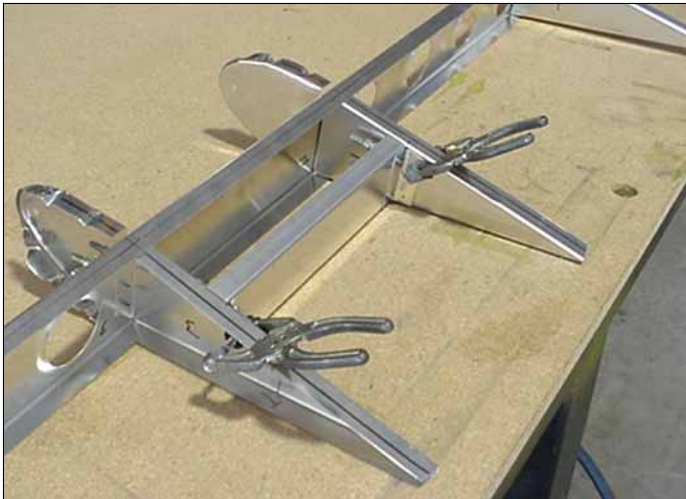
7H2-6 Elevator Channel

Securing the skeleton to the table is very helpful. Before installing the channel make sure to square the rear ribs (7H1-7).