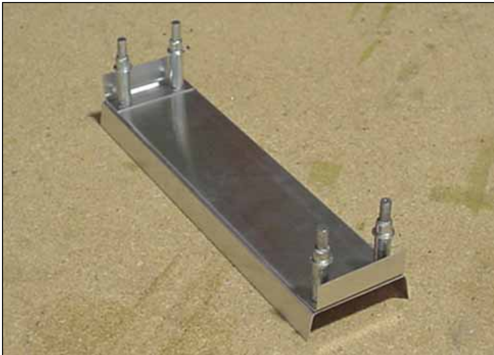
7H2-9 Elevator Channel

Position the "L" Angles flush with the ends of the channel. CHECK: outside to outside distance across the L angle is equal to the inside distance between the rear ribs 7H1-7 (approximately 260mm)