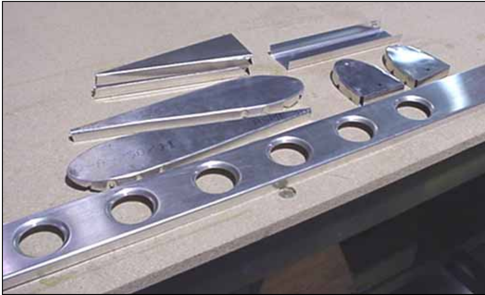
The elevator skeleton parts.