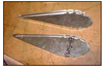
ELEVATOR TIP RIBS 7H1-5