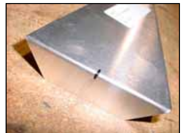
ELEVATOR REAR RIBS 7H1-7

LAYOUT: Mark the middle point of the front flange. Ref line A-A bottom right diagram on drawing 7-H-1. Also mark the center line at the end of the rib.