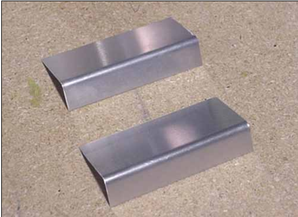
7V6-3 Rear Rib Angle