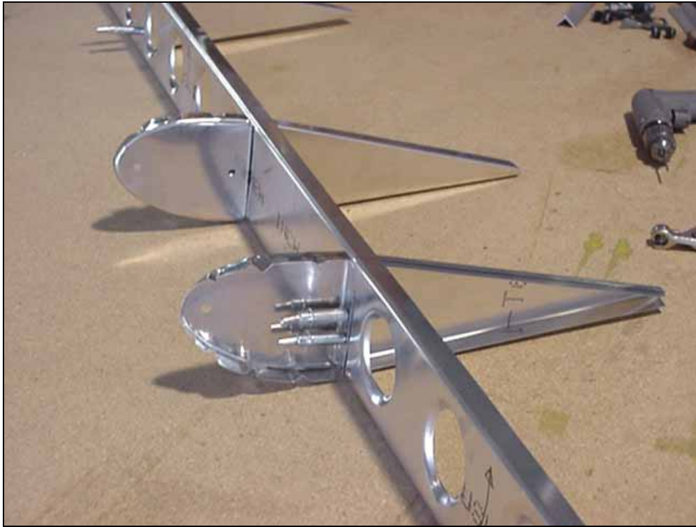
7H1-6 Elevator Nose Ribs