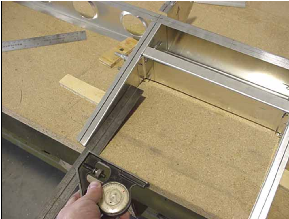
7H2-9 Elevator Channel

Securing the skeleton to the table is very helpful. Before installing the channel make sure to square the rear ribs (7H1-7).