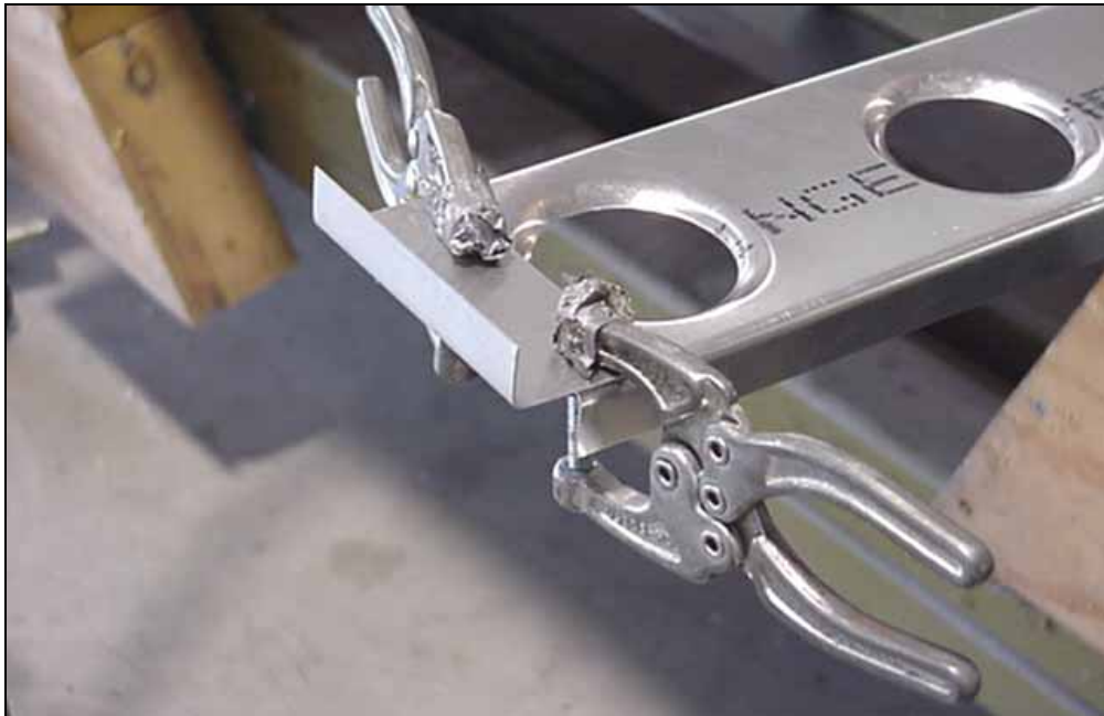
7H2-8 Elevator Spar 7V6-3 Rear Rib Angle

Clamp angle, 7V6-3, to the spar. Keep the bracket 90 degrees to the spar's flanged edge. Drill and cleco.