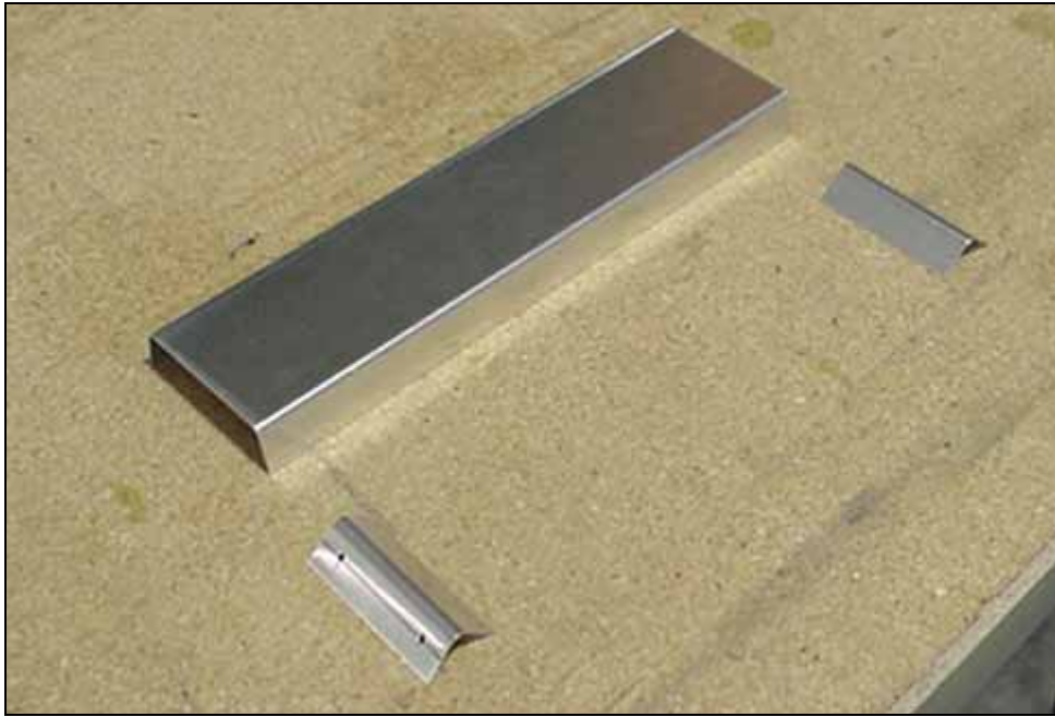
7H2-9 Elevator Channel "L" Angles Cutoffs