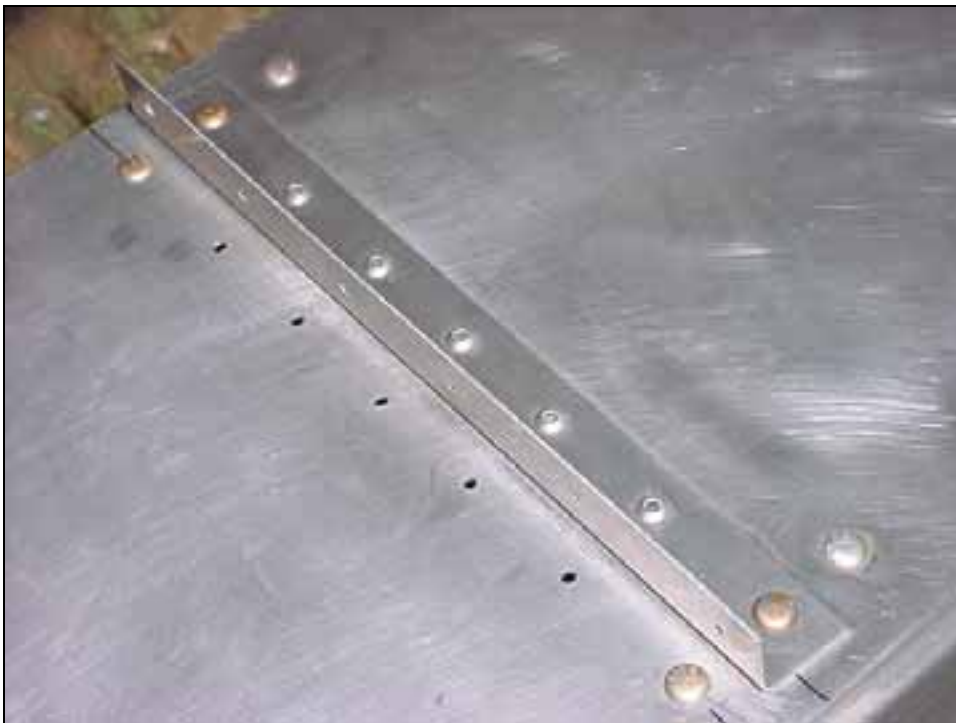
Long rib angles for NR #4 to NR #6 (installed on front side) See drawing 6-K-0 for location of NR #4 for standard 12 gallon tank