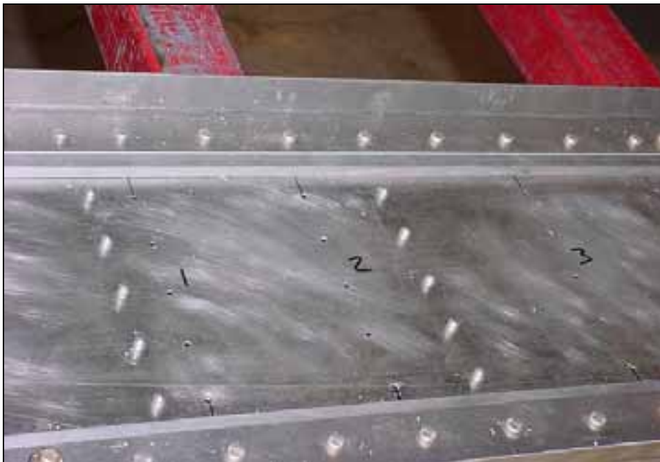
ORIENTATION: Top and bottom flanges point towards the rear.

Refer to drawing 6-W-3 to separate the left and right Wing Spar Assembly. The bottom of the spar is longer than the top.