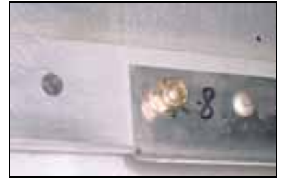
AN4 bolt at inboard end of bottom spar cap angle 6W3-7