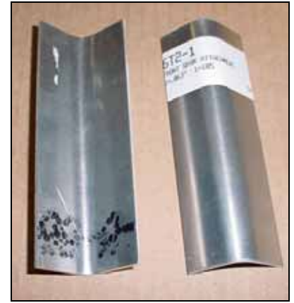
FRONT SPAR ATTACHMENT 6T2-1 Qty: 2 t=.063"

Clamp the Front Spar Attachment 6T2-1 to the side of the Attachment Doubler 6T2-2