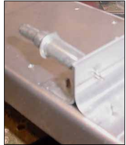
3 RIVETS A5 6T2-1 to 6T2-2