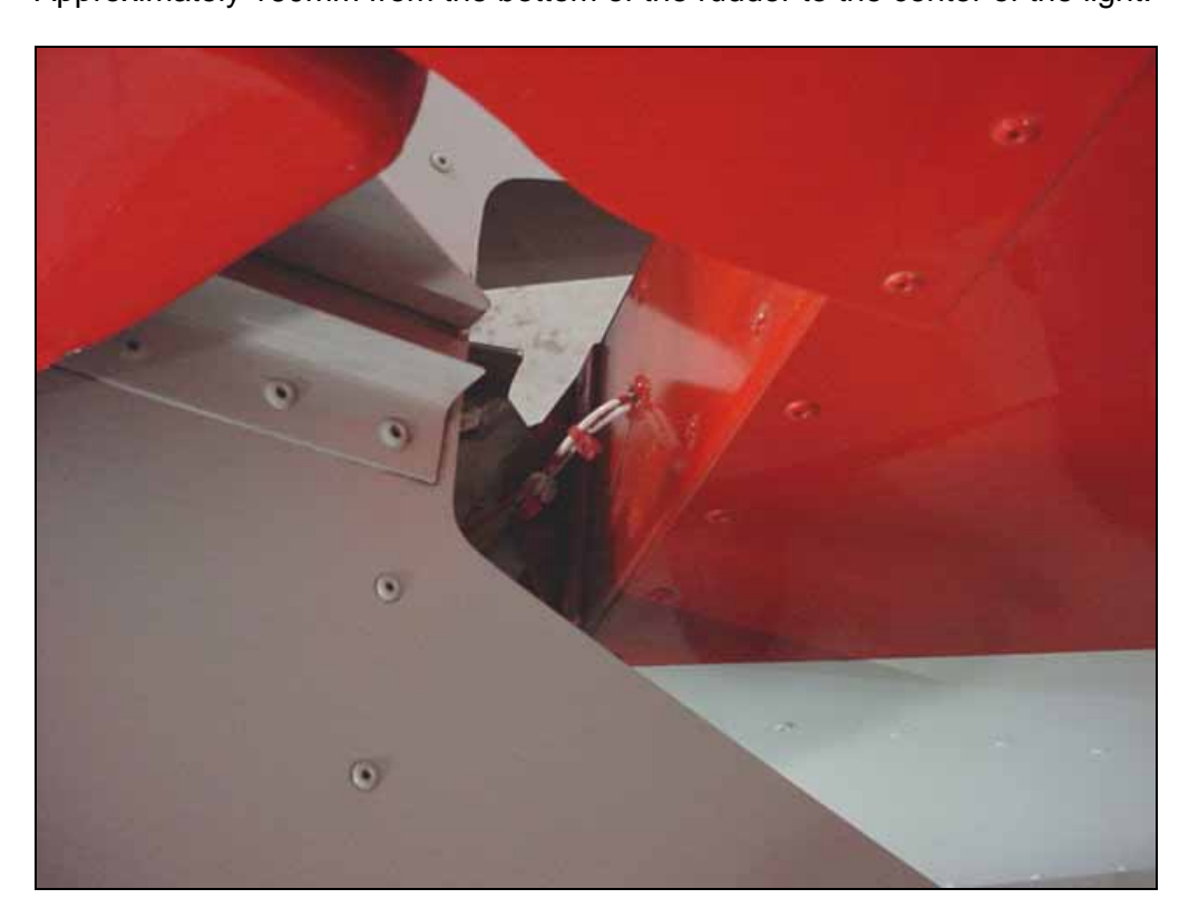
Grommet AN931-4-7 Qty: 1

The position light is installed after the rudder is completed (riveted). Approximately 160mm from the bottom of the rudder to the center of the light.