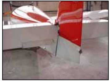
Rudder position tail light