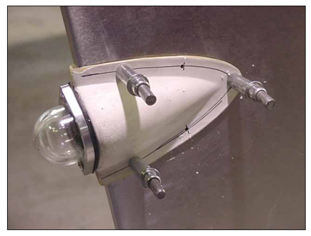
10 RIVETS A4