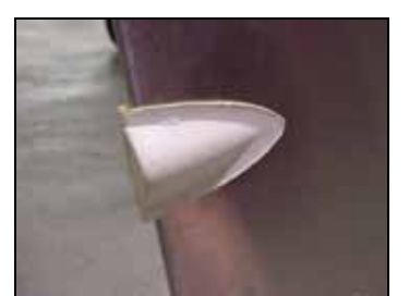
Bracket on trailing edge