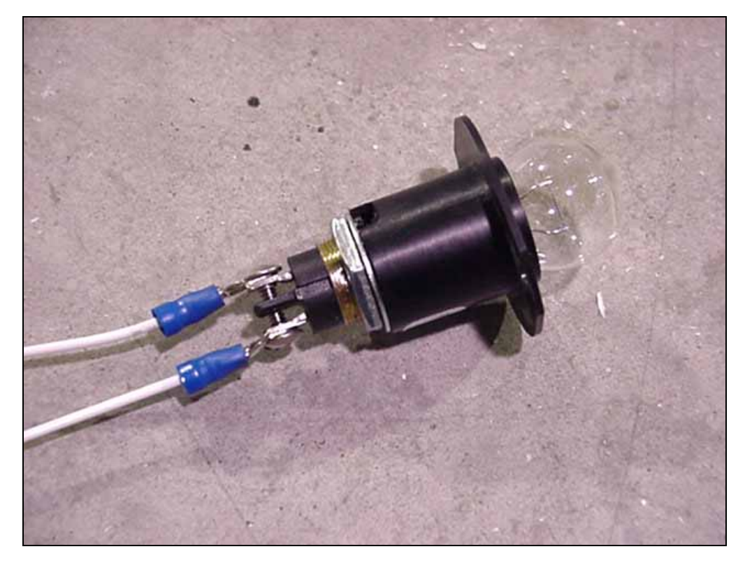
2 wires. The ground wire will be grounded to the fuselage.

Connect the electric wire to the taillight.