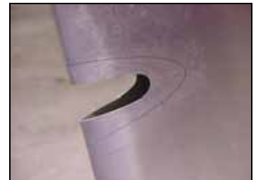
Cutout in trailing edge for the light.

Position the fiberglass bracket over the tailing edge of the rudder, trace around the outer flange.