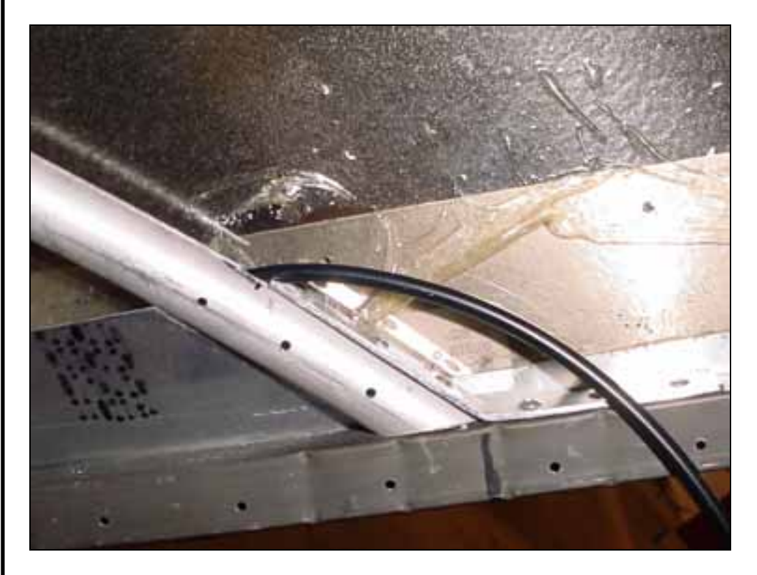
Flexible cable housing P/N 172-66 through front tube frame 6C3-2