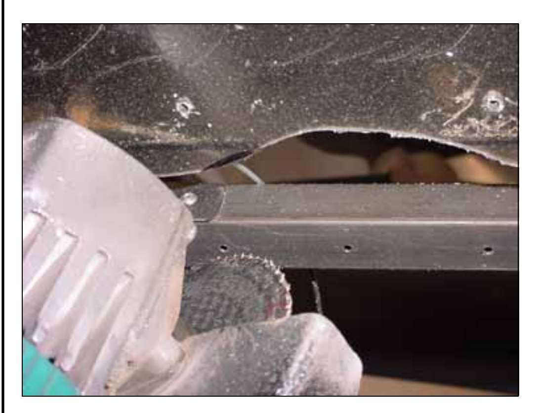
Use a hand grinder to cut bubble canopy.