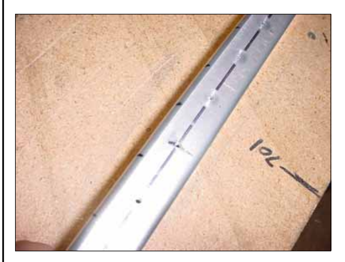
Top rivet line between the crimps.