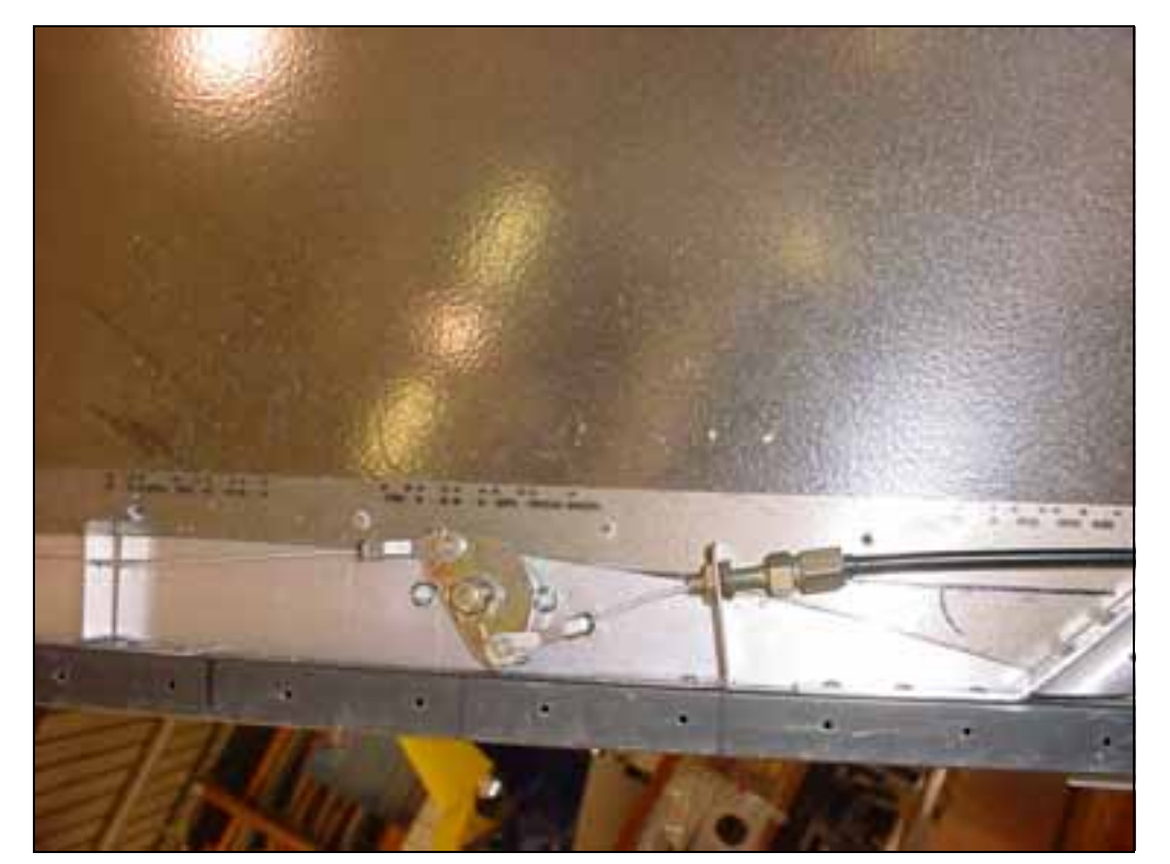
STRAP FORK END P/N SA262-2 with CLEVIS PIN.