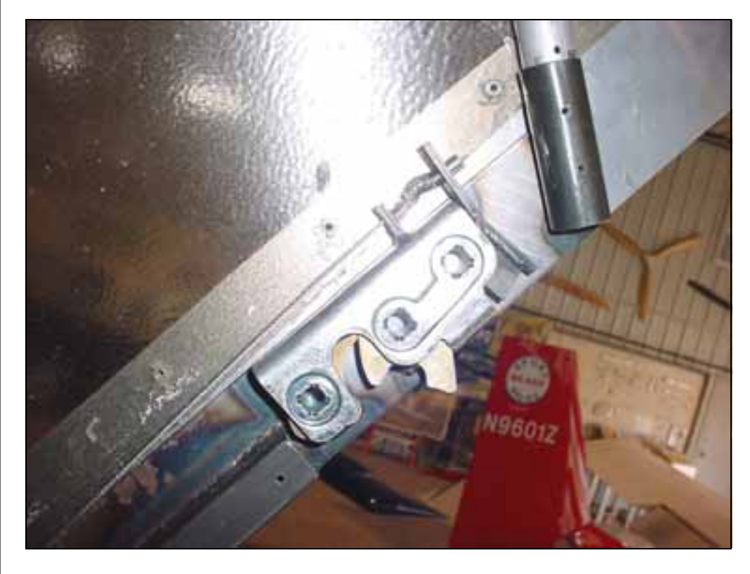
Throttle stop P/N 1548 Or Nico press sleeve.