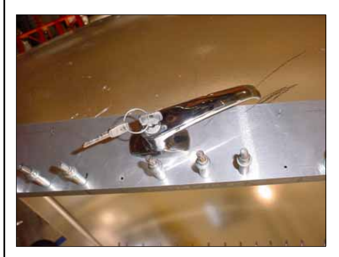
Larger handle with lock and key P/N 1226A62