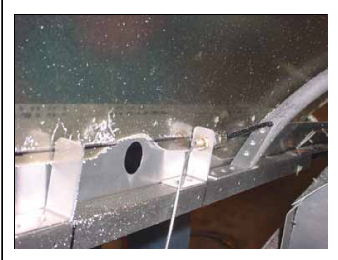
Cut the canopy to make room for the hole