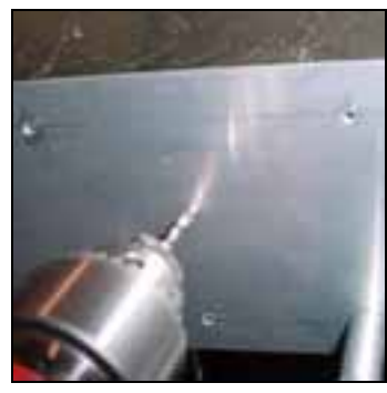
Locate the center of the hangle, 35mm up from the bottom