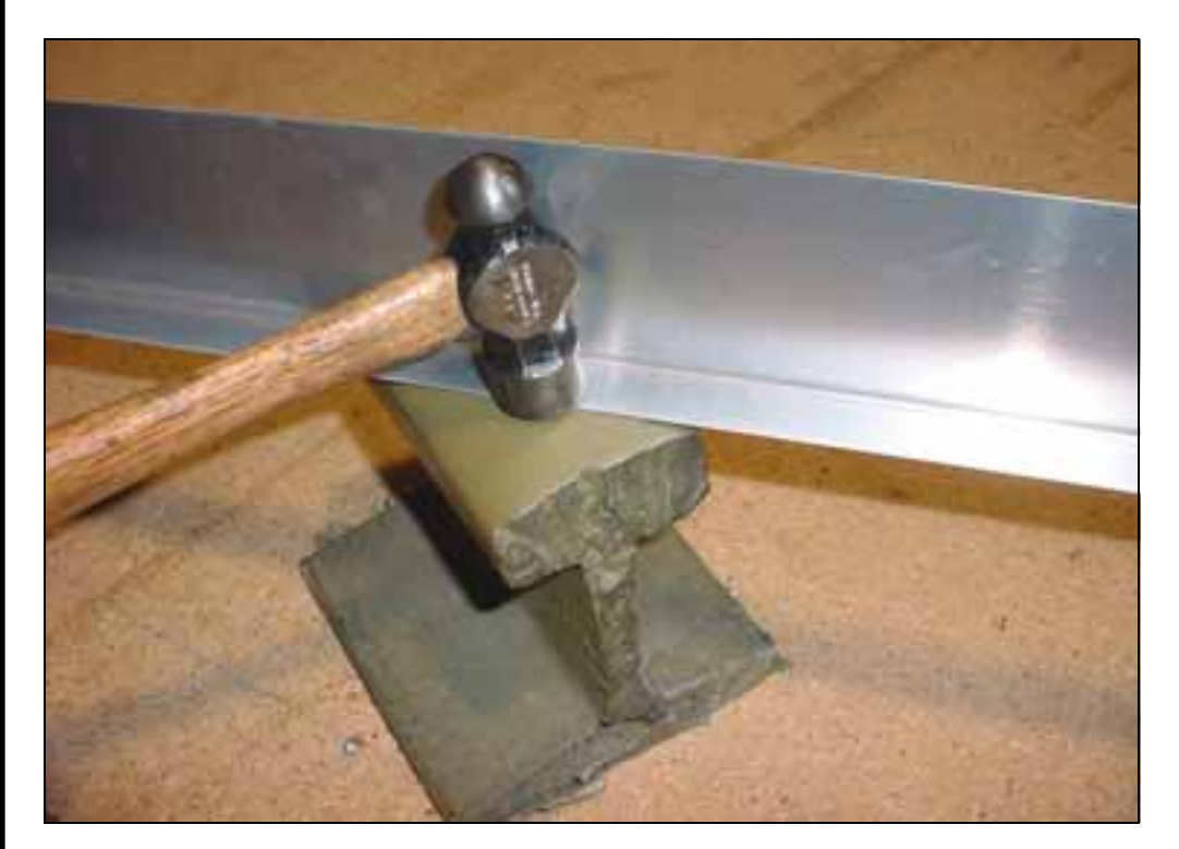
INSIDE FLASHING 6C3-5

Stretch the top flange to bend the flashing to follow the curvature of the fuselage side.