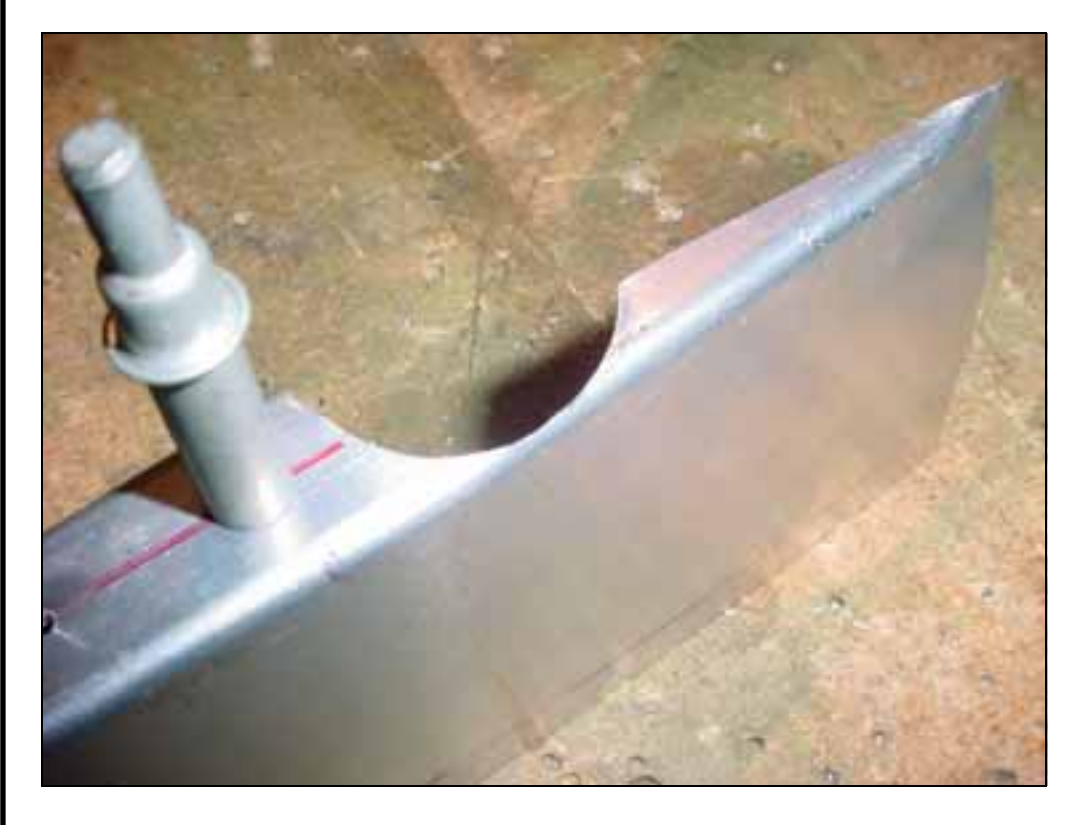
Detail of cutout in top flange to make room for the front tube.