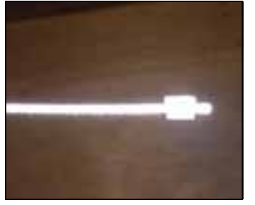
Nico press the stop sleeve P/N 871-1C