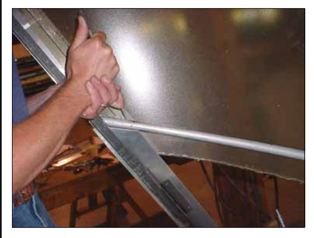
With a file open the hole along the bottom an top (elongated hole for cable housing)