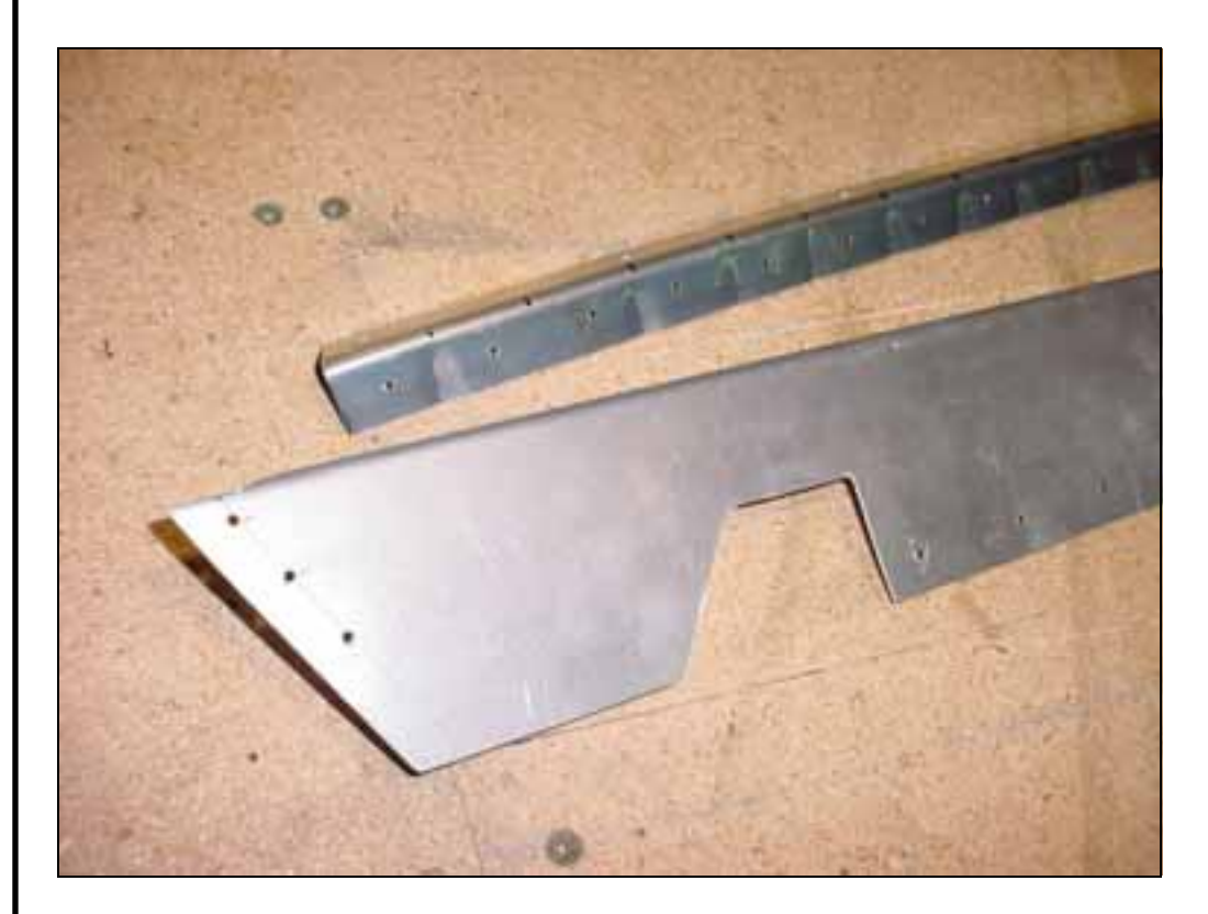
3 rivets A4 inside flashing to the 7/8" tube welded on the canopy frame.