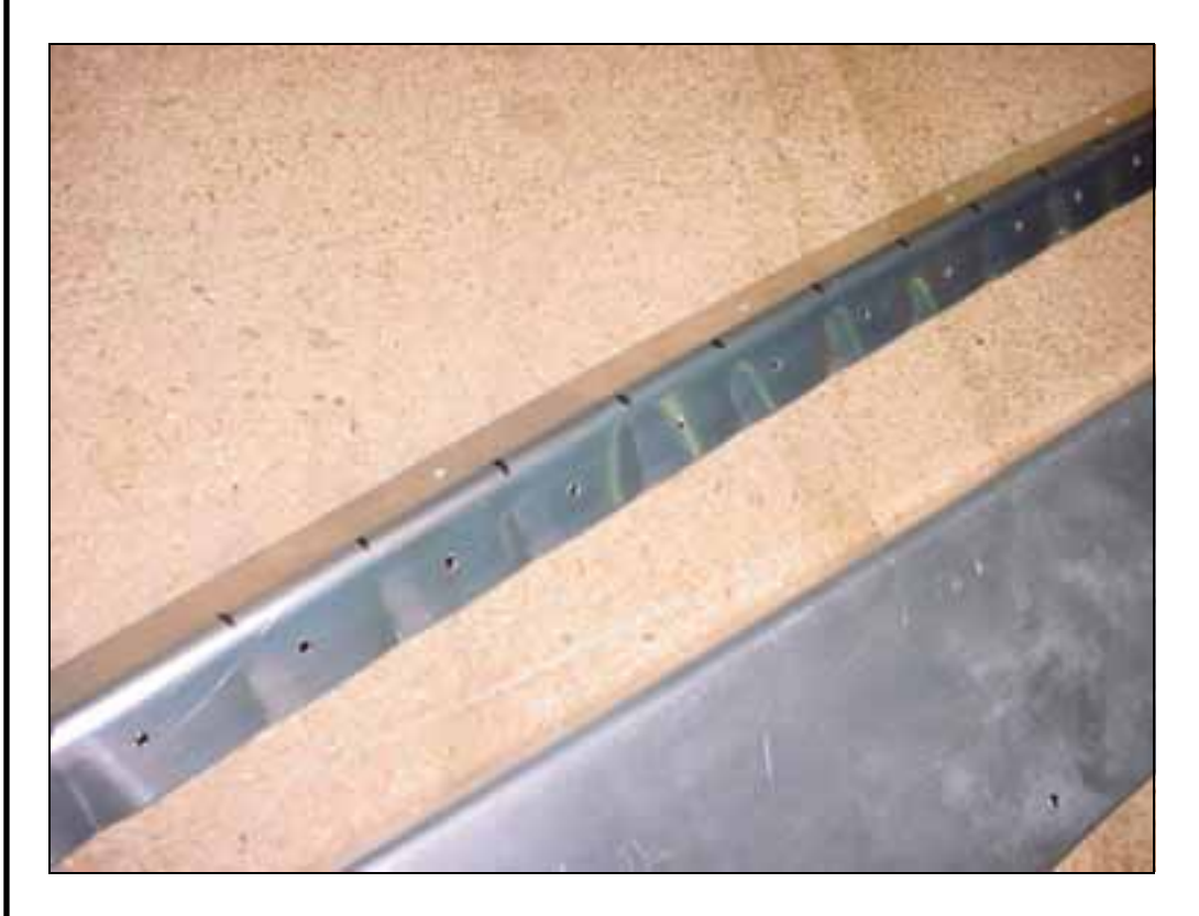
Layout intervals of 40mm along the radius of the inside flange 6C3-4 Crimp the side flange along the 40mm marks