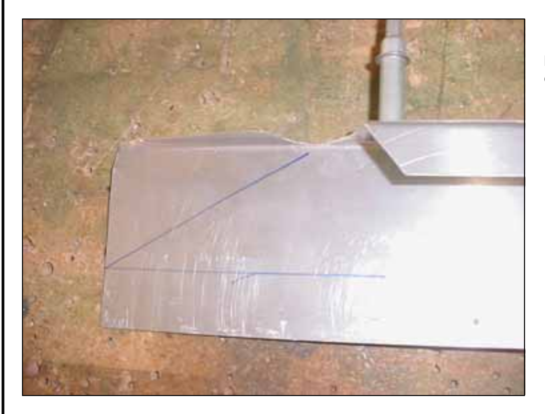
Ref. Cross section A-A bottom right diagram on drawing 6-C-3