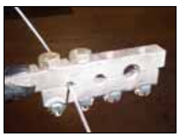
Nicopress tool hand swedge P/N HST-2 Wicks Aircraft Supply www.wicksaircraft.com