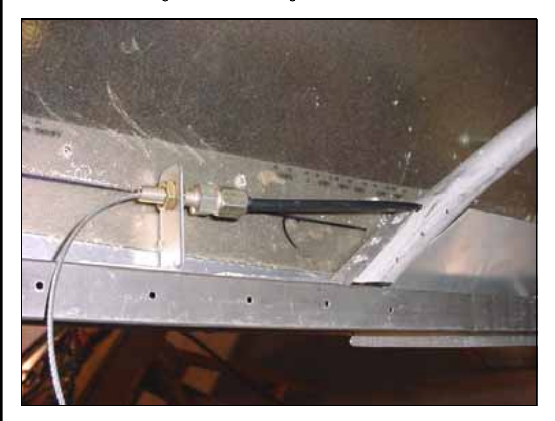
Dans a drill his 4h marsh 4h