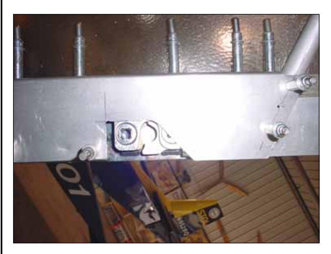
Inside flashing; right side (rear)