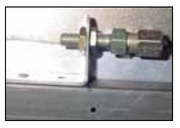
Cable stop adjuster with sleeve P/N 25-0700