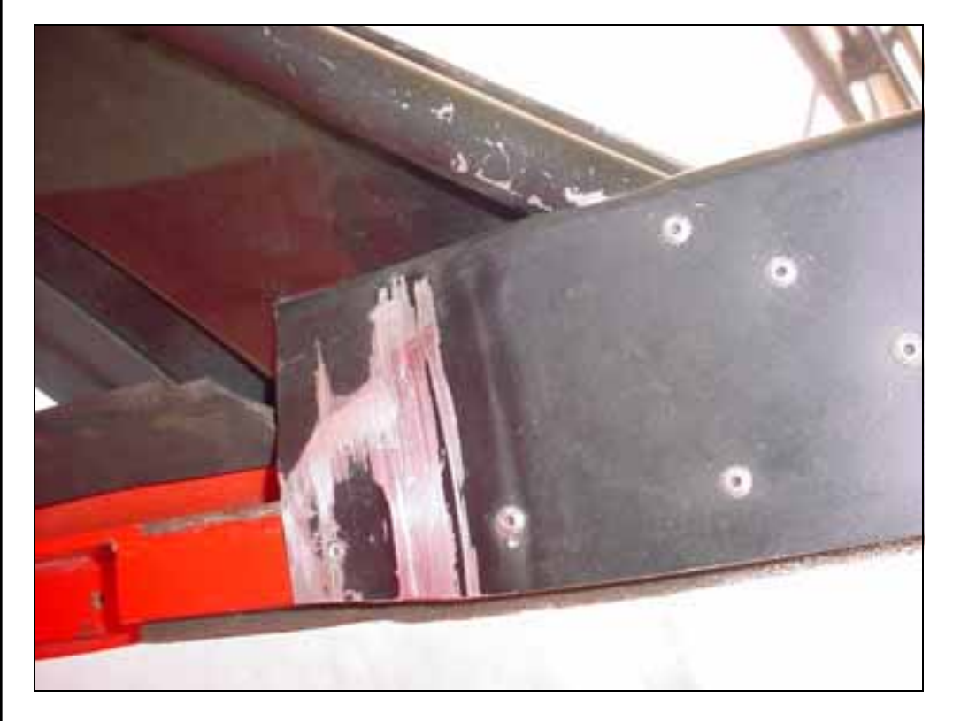
Detail of front end 3 rivets A4 inside flashing to the front canopy tube 6C3-2