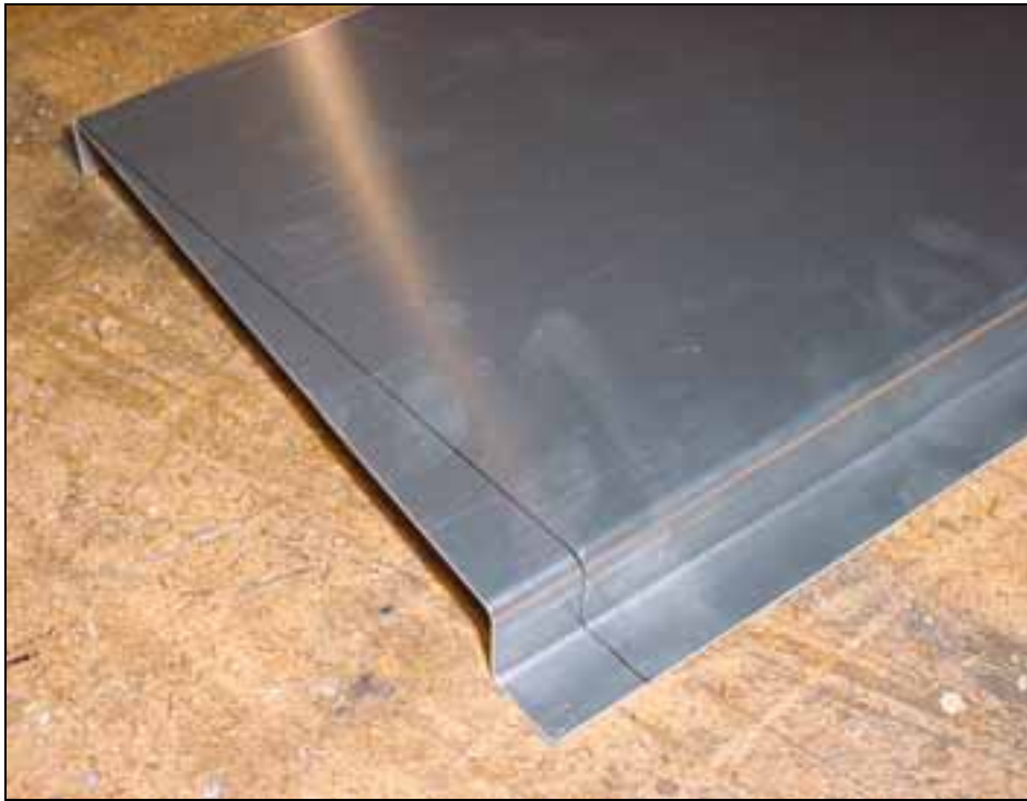
GEAR CHANNEL 6B5-5